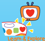
Learn & Explore

The Watch & Learn Mode functions as a learning video. With over thirty minutes of stimulating images and playful animations, toddlers will be introduced to a variety of learning curriculum including baby sign language, colors, shapes, numbers, vocabulary and much more.