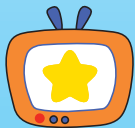
Watch & Learn

The Play Time Mode was designed specifically with curious babies in mind. This mode of play allows toddlers to explore each of the activities with the press of a button. Toddlers will be rewarded with fun animations, sounds and basic learning curriculum.